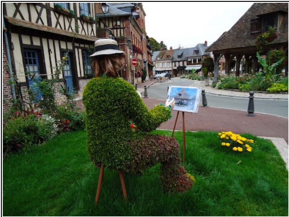
Lyons La Foret