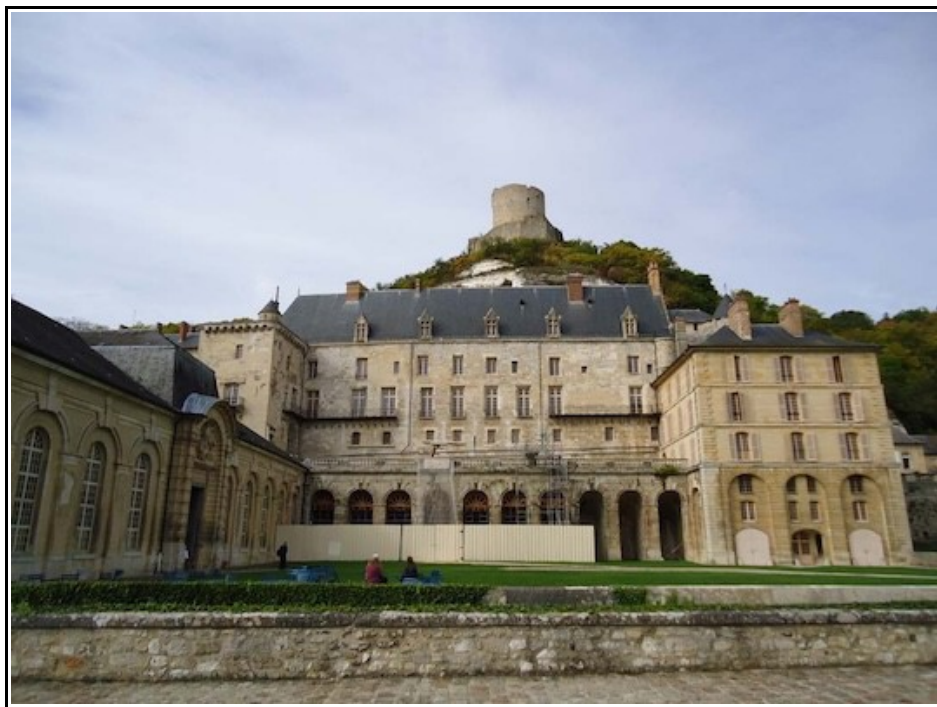
La Roche Guyon Castle