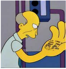
Featuring Big Hand Openers