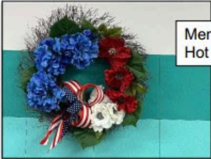
Memorial Day 2024 Hot Diggity Dog