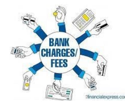
ment system. However, we did

We thought we were ahead of the game in our cashless pay-