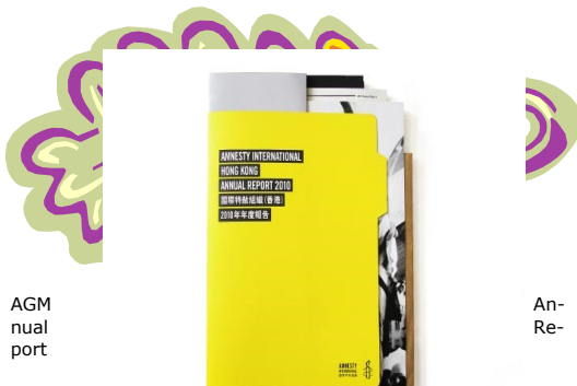
AGM nual port

We could do a zoom, houseparty or Microsoft team but these are a bit tricky to organize and probably not worth the effort. So our choice is to ask you questions to get your feedback on how we are doing, how you might contribute and what you think we should do next. We will also provide you with an