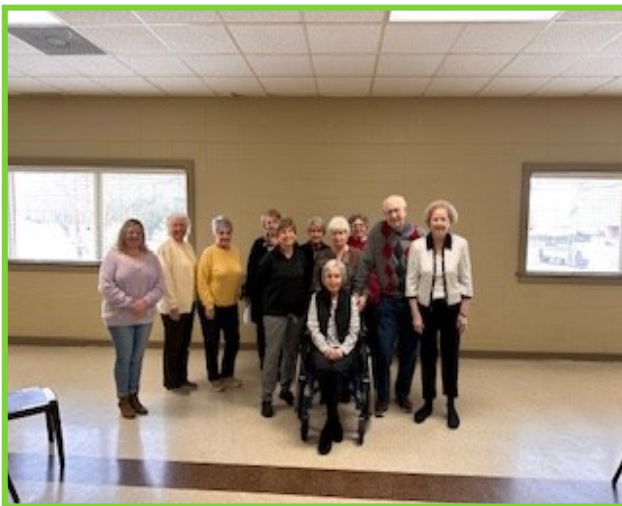
Members of Unit 214 pose for a photo at the presentation of the donation to The Pink Ribbon Fund.