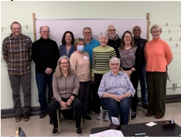
A big welcome to our Class of '22.

The Board has extended free 2023 membership to all our members and new players.