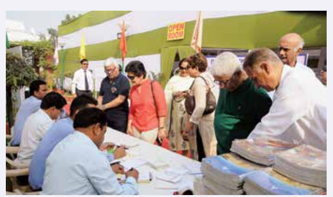
Participants at the Registration Desk